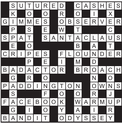
Solution No 124

Haha, that's funny! (5,6) 24 Fed up with leaders of rubbish, awful Government dept (5)